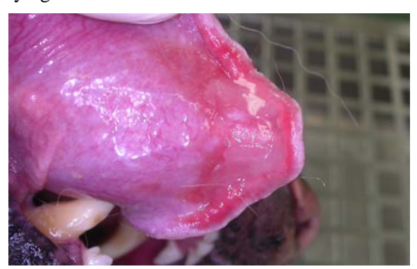
Yet this edentulous (toothless) area (right mandible) is free of lesions.